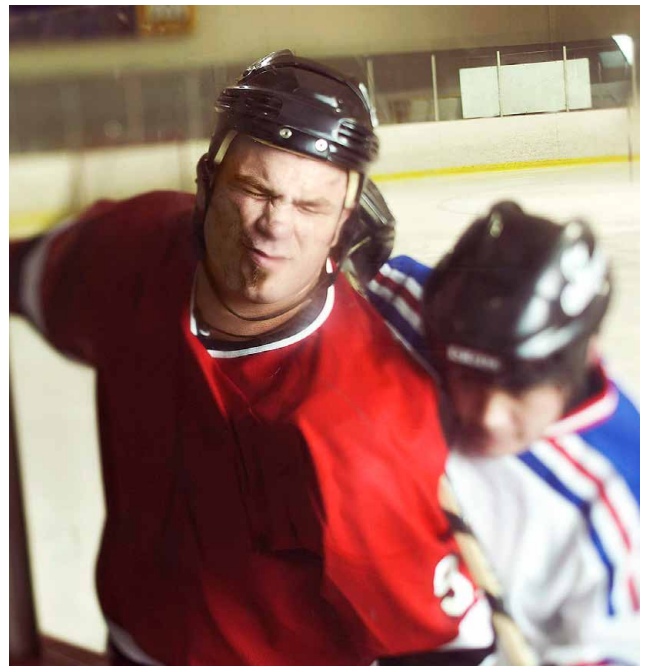
Less risk for concussions thanks to flexing sheets.