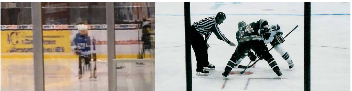
There is a difference between sheet qualities. With POLYCARBONATE SAPHIR® sheets high optical properties are guaranteed.