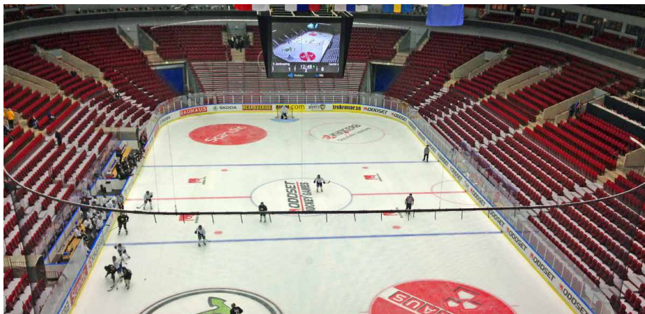
Malmö arena, Malmö, Sweden