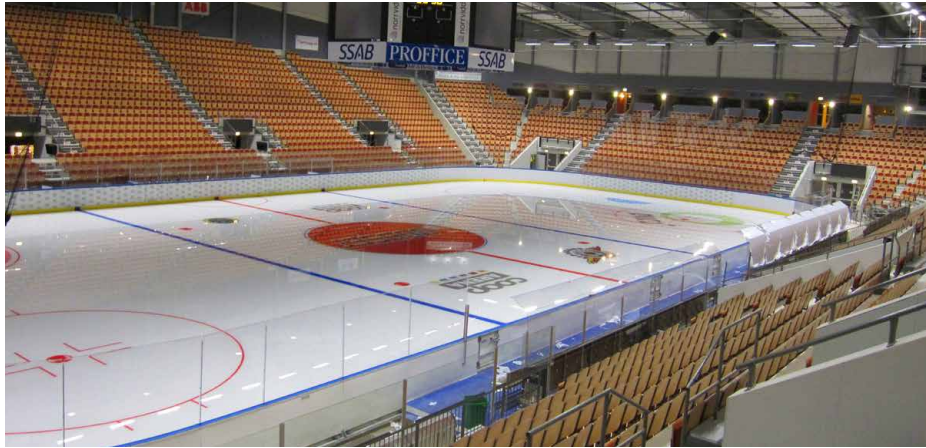
COOP arena, Luleå, Sweden