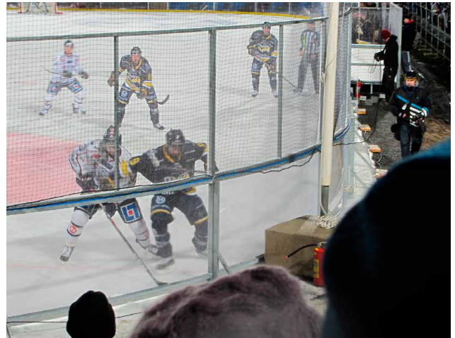
Visibility all the way down to the ice, gives a better visual and media experience.

Polycarbonate sheets themselves are virtually unbreakable. By adding a hard top coating the sheet obtains a good protection against abrasion and chemicals. We only use sheets with excellent clarity and good optical properties for our POLYCARBONATE SAPHIR® range.