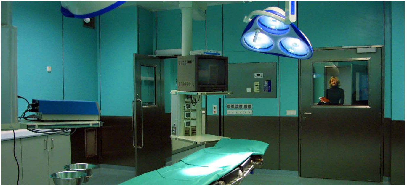
Hospital environment. The constant moving of medical equipment or beds brings frequent impact and wear to the walls.