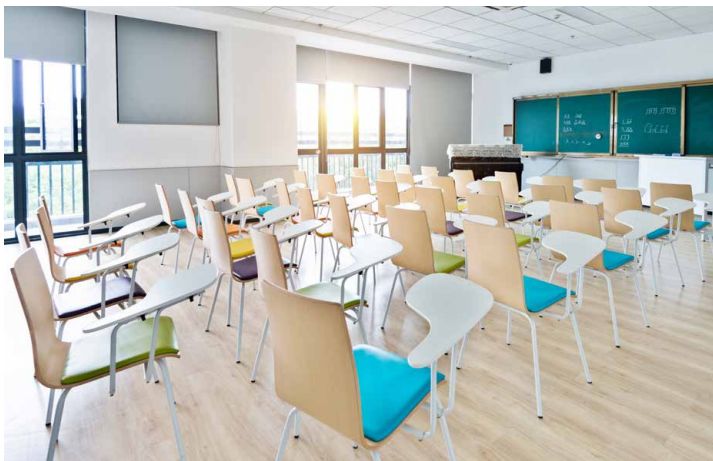
POLYCARBONATE OPAQUE ATECH® 7000 is a robust protection in lower part of walls in public buildings or schools.