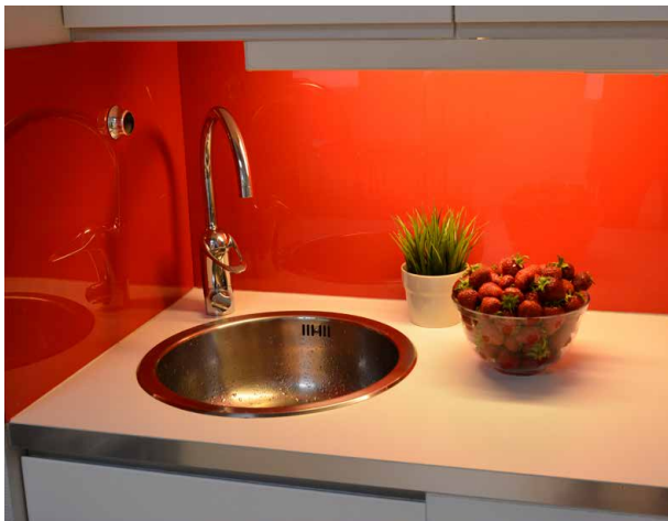
In kitchens, POLYCARBONATE OPAQUE ATECH® 7000 offers a smooth, water resistant surface that is easy to keep clean.